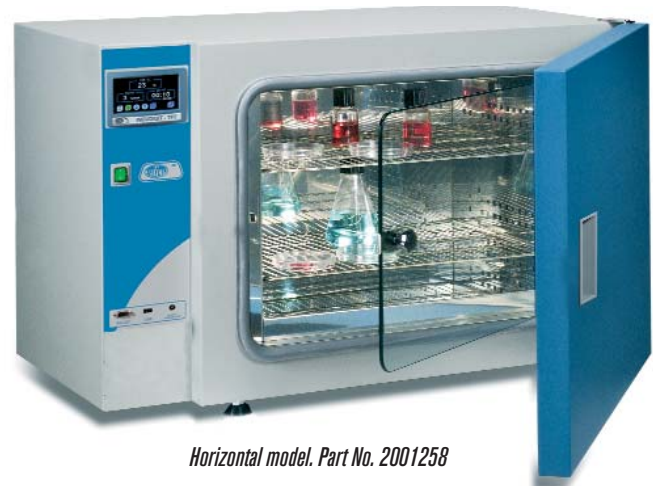
Horizontal model. Part No. 2001258