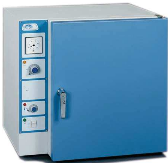
Models Conterm, Part No. 2000208, 2000209 and 2000210.

FEATURES, CONTROL PANEL, SAFETY, STANDARD AND ACCESSORIES (see pages 139 and 140).