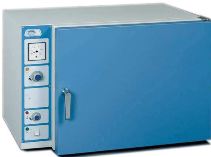
Model Conterm type Poupinel, Part No. 2000200 and 2000201.