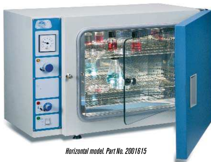
Horizontal model. Part No. 2001615